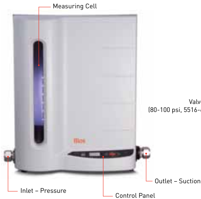
Figure 1: Front View, Definer 1020